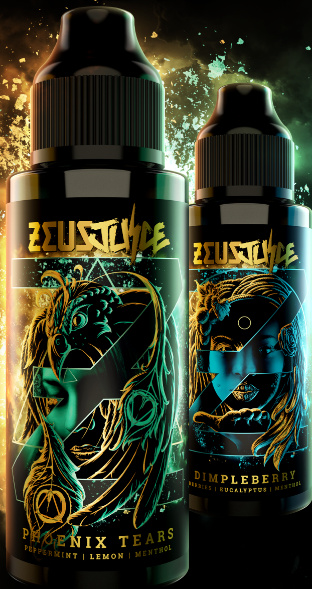
Pictured: Zeus Juice - Phoenix Tears & Dimpleberry 100ml e-liquids